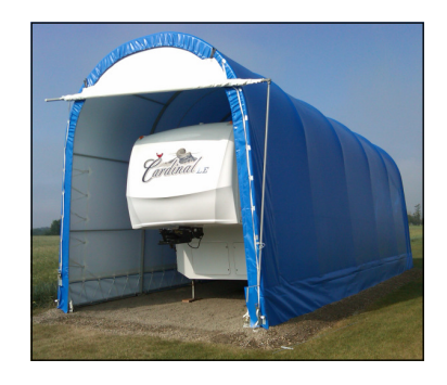
High Profile 15' wide